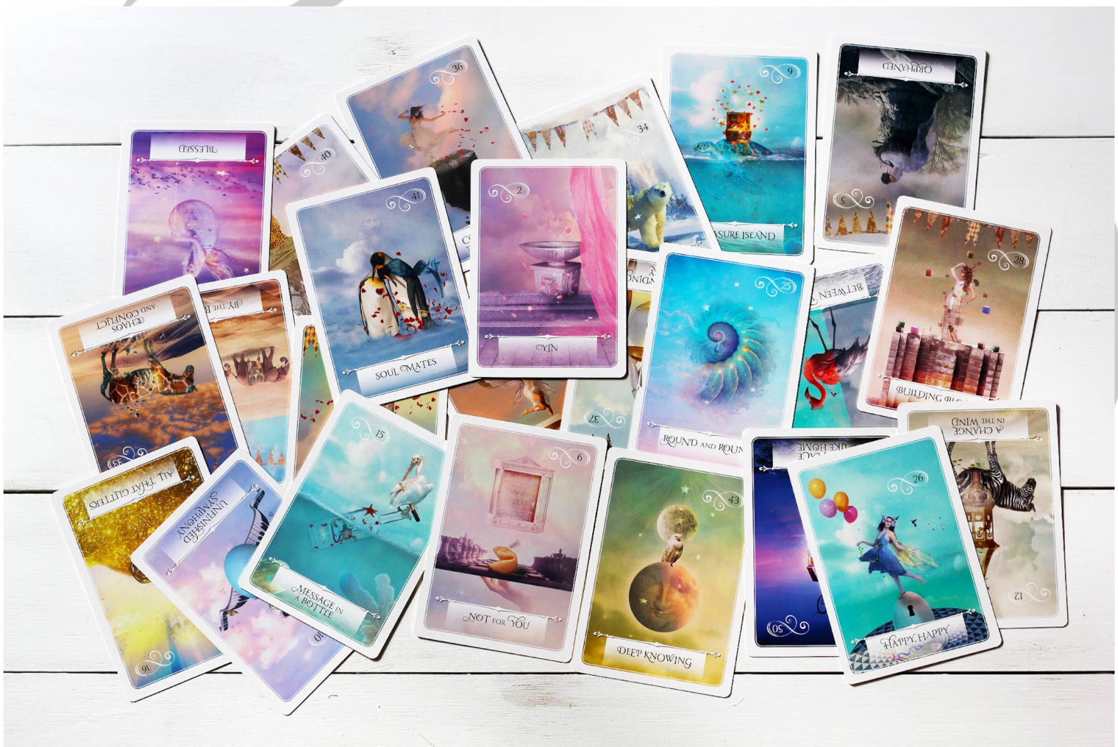
Wisdom Of The Oracle Divination Cards by Colette Baron-Reid

Try out different tools to use like Tarot or Oracle cards and experiment with what you connect to. We have to try a few pairs of pants on before we find ones that fit just right. This is the same with the various tools and methods in intuition development.